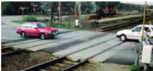
GRADE CROSSING SYSTEM