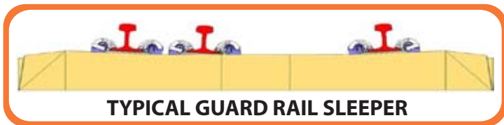
TYPICAL GUARD RAIL SLEEPER