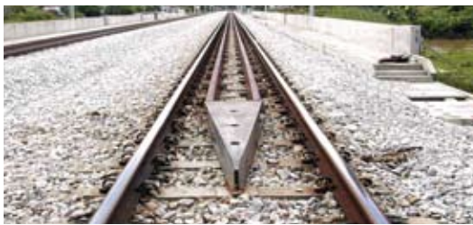
GUARD RAIL SLEEPER ON BRIDGE